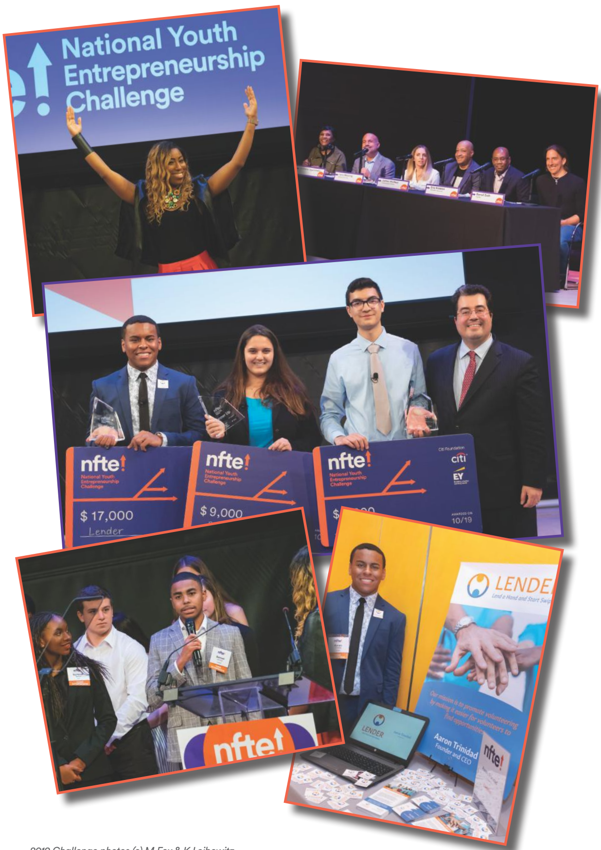
2019 Challenge photos