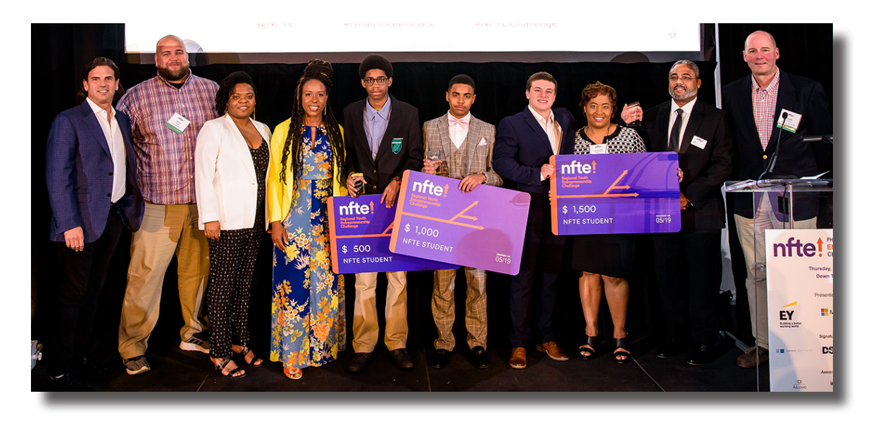
our 2019 finalists with the judges

Sierra's Fidget workshop provides custom fidget poppers and spinners for customers suffering from anxiety when facing challenging situations. Customers can also host a fidget workshop where they can paint the fidget products and take home with them the same day.