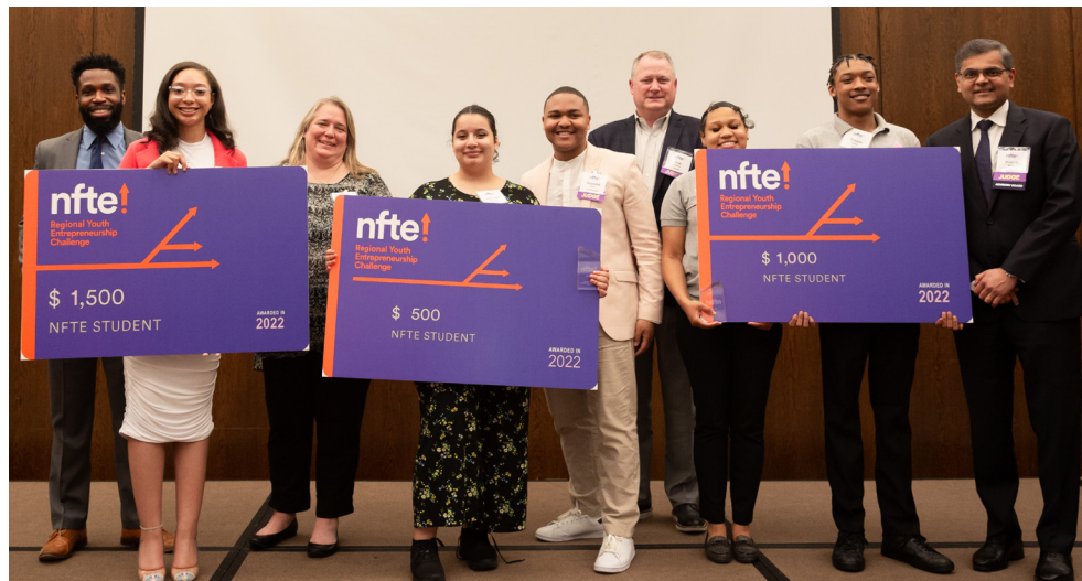
2022 finalists with the judges