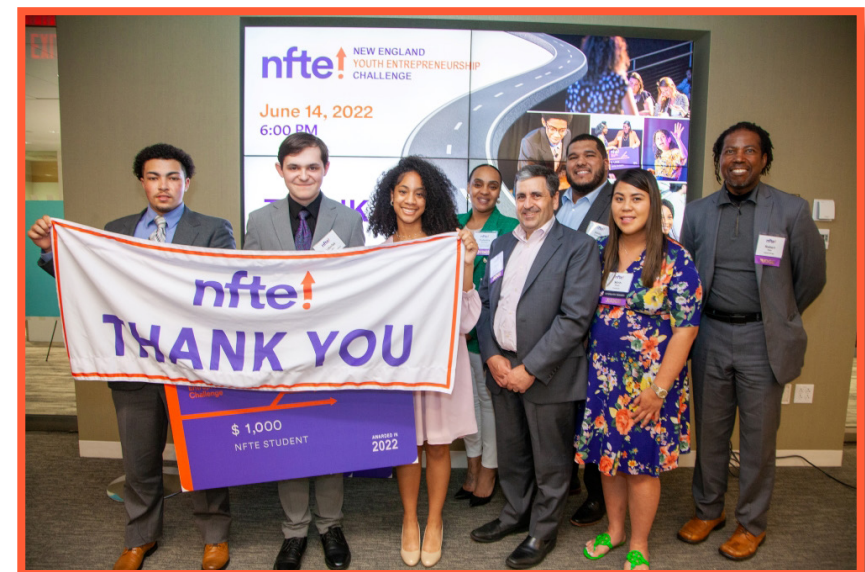
2022 winners & judges

Lilypad offers BIPOC entrepreneurs the opportunity to rent a food truck to test their culinary concepts in a low-cost, risk-free environment.