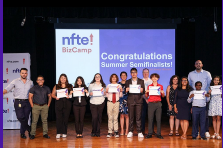
Student semifinalists at the GEAR UP Miami BizCamp in summer 2024

Throughout the program, students were required to create an app for their businesses and earned Intuit's Design 4 Delight (D4D) and Google Cloud certifications. NFTE provided facilitators and interns, while the GEAR UP team offered classroom support. To accommodate students and families, an in-person orientation was held, along with virtual classes on Juneteenth and July 5th to ensure no instructional time was lost. Financial literacy workshops from Dade County Federal Credit Union, virtual coaching from Everfi and Santander, and support for non-English speaking families were key elements of the program. Two students advanced to pitch their business ideas at the Grant Cardone Foundation, where they toured the facility and presented their concepts to the team.