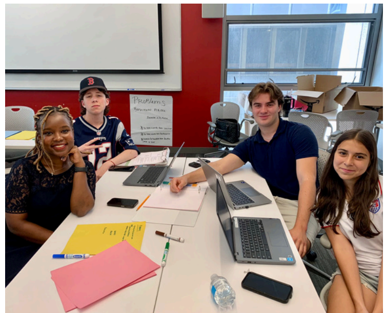
Students participate in BizCamp in July 2024