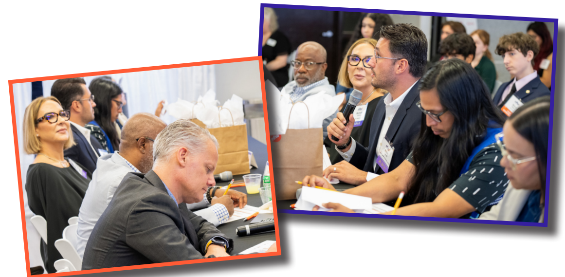
2024 Challenge Judges