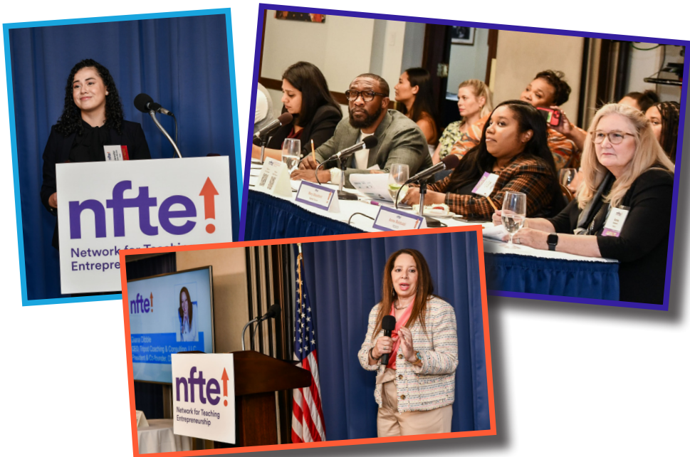
2023 Challenge speakers and judges

Prior to joining the American University faculty, she founded and operated a climate change motivated grocery store called Glen's Garden Market in Dupont Circle. Glen's was beloved locally and recognized nationally as a leader in sustainability and innovation. She sold the business in 2021.