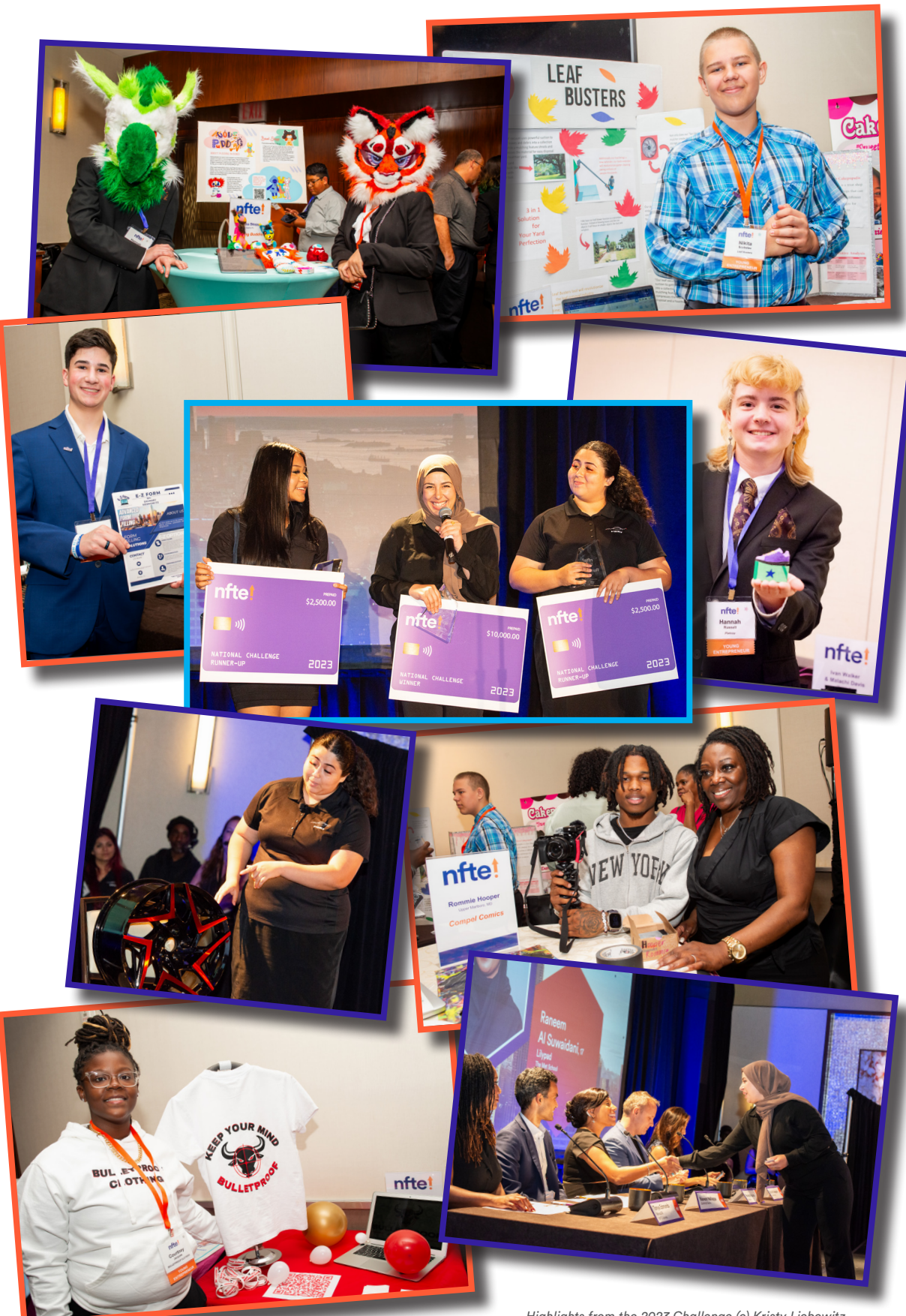
Highlights from the 2023 Challenge