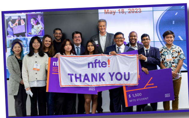
2023 Challenge finalists & judges

At Bow-Ache we seek to provide a non-pharmaceutical, all natural headache relief option to help reduce and relieve severity of migraines. As we target the 26 million women in the United States who suffer from migraines, especially those with higher stress levels, we desire to provide a convenient, cute, and affordable form of relief. Many are looking for a migraine relief option that allows them to not have to swallow a pill but also something that they can wear as they continue to work.