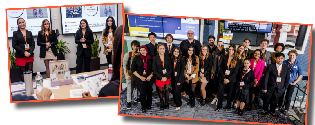
Global competitors at the 2023 World Youth Entrepreneurship Challenge