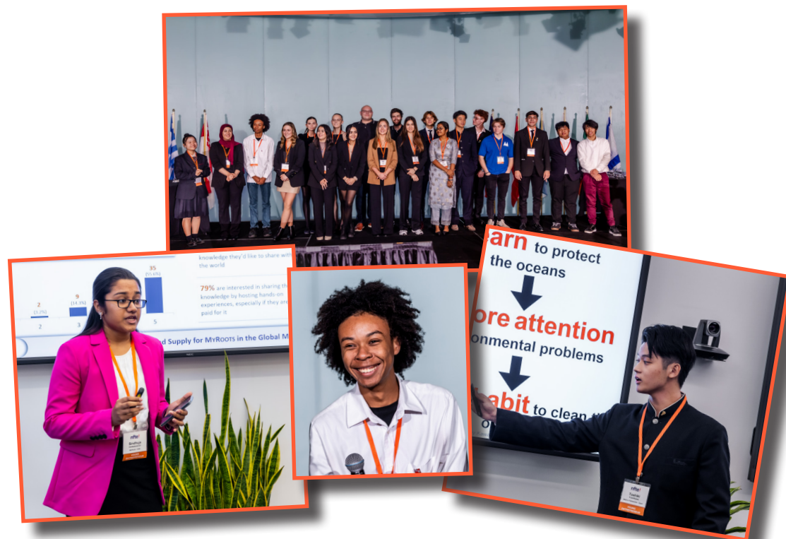
Global competitors at the 2023 World Youth Entrepreneurship Challenge