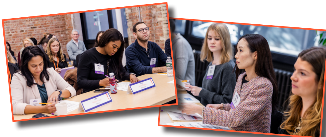
Semifinal judges at the 2023 World Youth Entrepreneurship Challenge